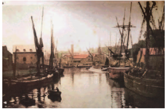
Arthur Percival Collection